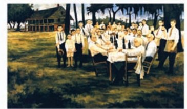
Aioli Dinner , 1971, by George Rodrigue

The George Rodrigue Foundation of the Arts advocates the importance of the visual arts in the development of our youth, encourages the use of art within all curriculums, and supports a variety of art educational programs. For more information, visit: www.georgerodriguefoundation.org .